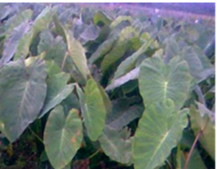
Figure 1. Cocoyam tubers and plants

Determination of force required to peel the periderm of cocoyam